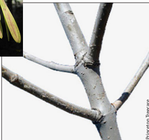
Opposite branching pattern.

Leaves have five to eleven leaflets with toothed or smooth edges on a short stalk.