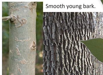
Smooth young bark.