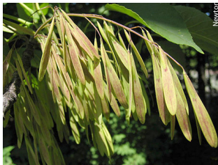
Oar-shaped seeds usually occur in clusters and hang on female trees from mid-summer until early winter.