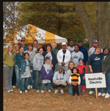
NES employees supported the American Heart Association at the Nashville Heart Walk.