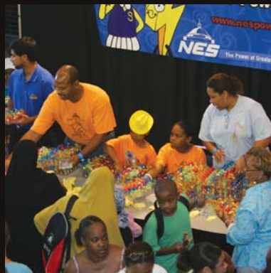
NES provided fun, lightbulb-shaped pencil sharpeners during Mayor's First Day.