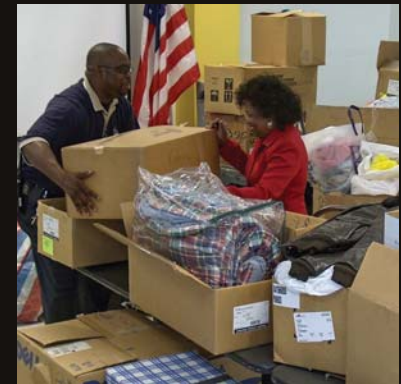
NES employees worked together to collect supplies for victims of Hurricane Katrina.