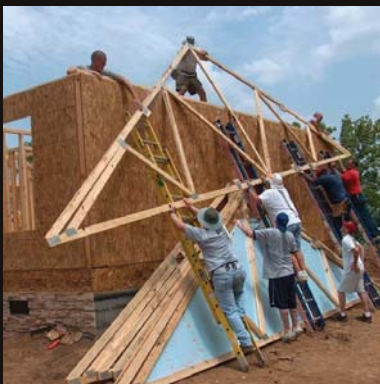
NES employees helped build seven new homes with Habitat for Humanity.

NES employees also contribute time and money to benefit a variety of community organizations, including 100 Black Men of Middle Tennessee, Habitat for Humanity, Mayor's First Day, Mayor's Night Out, Conexión Americas, Easter Seals, Oasis Center, ReLeaf Nashville, St. Luke's Community House, Nashville Night Out Against Crime and many others.